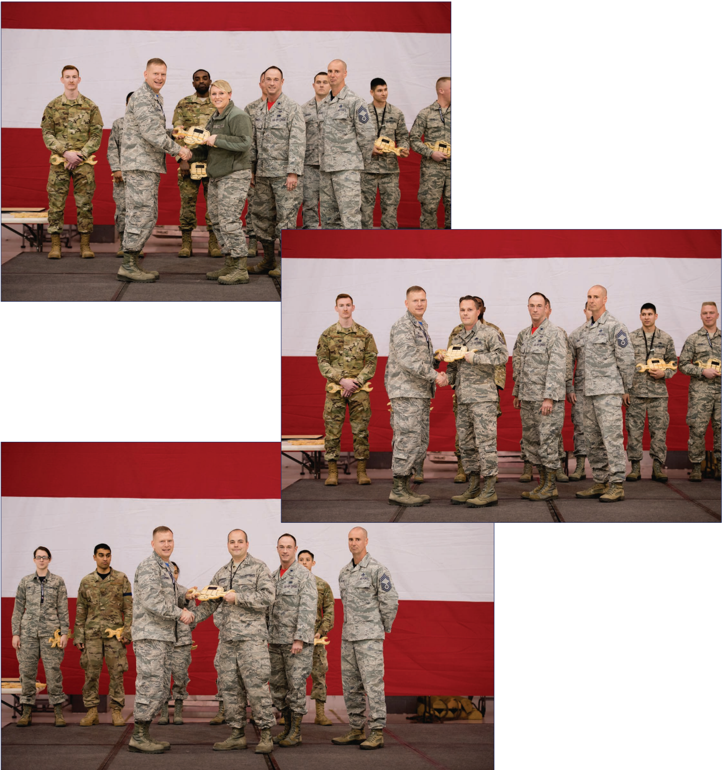
Mission: To provide combat-ready AWACS Citizen Airmen to Fly, Fight & Win