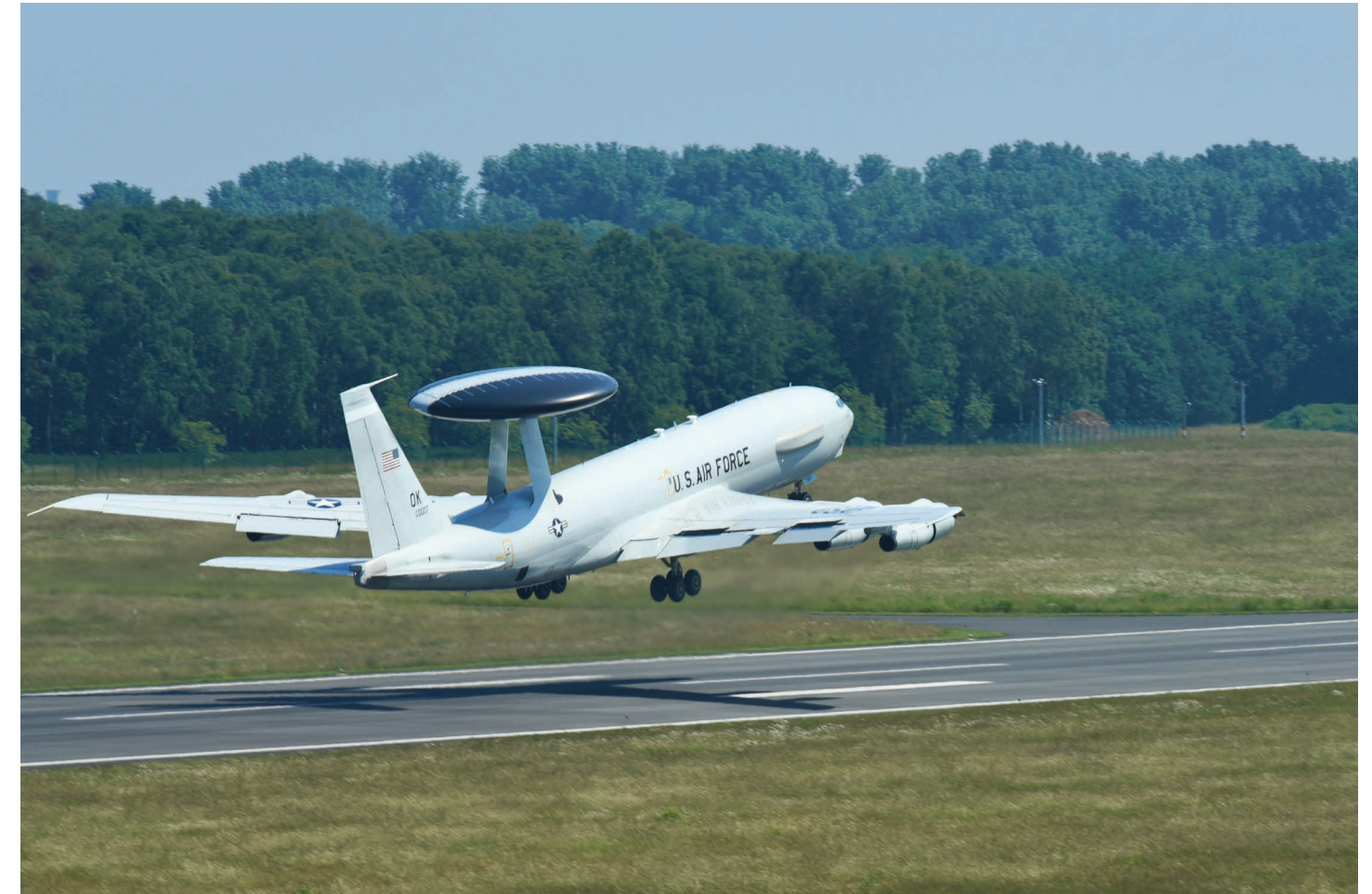
A U.S. Air Force E-3 Sentry Airborne Warning and Control System aircraft assigned to Tinker Air Force Base, Oklahoma, takes off in support of Exercise Baltic Operations at NATO Air Base Geilenkirchen, Germany, June 6, 2018. BALTOPS involves maritime, ground and air forces so as to strengthen combined response capabilities necessary to ensure regional stability.

With the general’s words in mind, the 513th ACG and 552nd ACW paired up their best personnel for BALTOPS 18 this summer. As a director of operations of the Air Force’s only reserve AWACS unit, and DETCO,