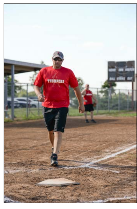
By Staff Sgt. Caleb Wanzer