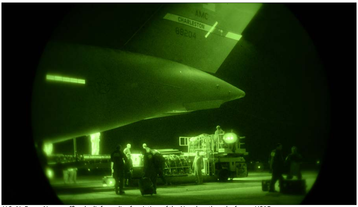
U.S. Air Force Airmen offload relief supplies for victims of the Nepal earthquake from a USAF C-17 Globemaster III April 28, 2015.