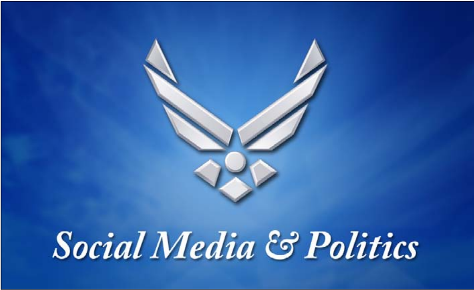
Air Force illustration by Staff Sgt. Caleb Wanzer

According to a list of DoD and Air Force Instructions longer than the average Airman's arm, which includes the 2014-2015 Voting Assistance Guide, DoDI 1000.04, Federal Voting Assistance Program (FVAP) And Directive-Type Memorandum (DTM), 10-021, Guidance In Implementing Installation Voter Assistance Offices (IVAOS), DoDD 1344.13, Implementation of The National Voter Registration Act (NVRA), and U.S Office of Special Counsel, Frequently Asked Questions Regarding Social Media and the Hatch Act, dated April 4, 2012, participating in politics is prohibited for members of the DoD and Department of Homeland Security when that participation can be in-