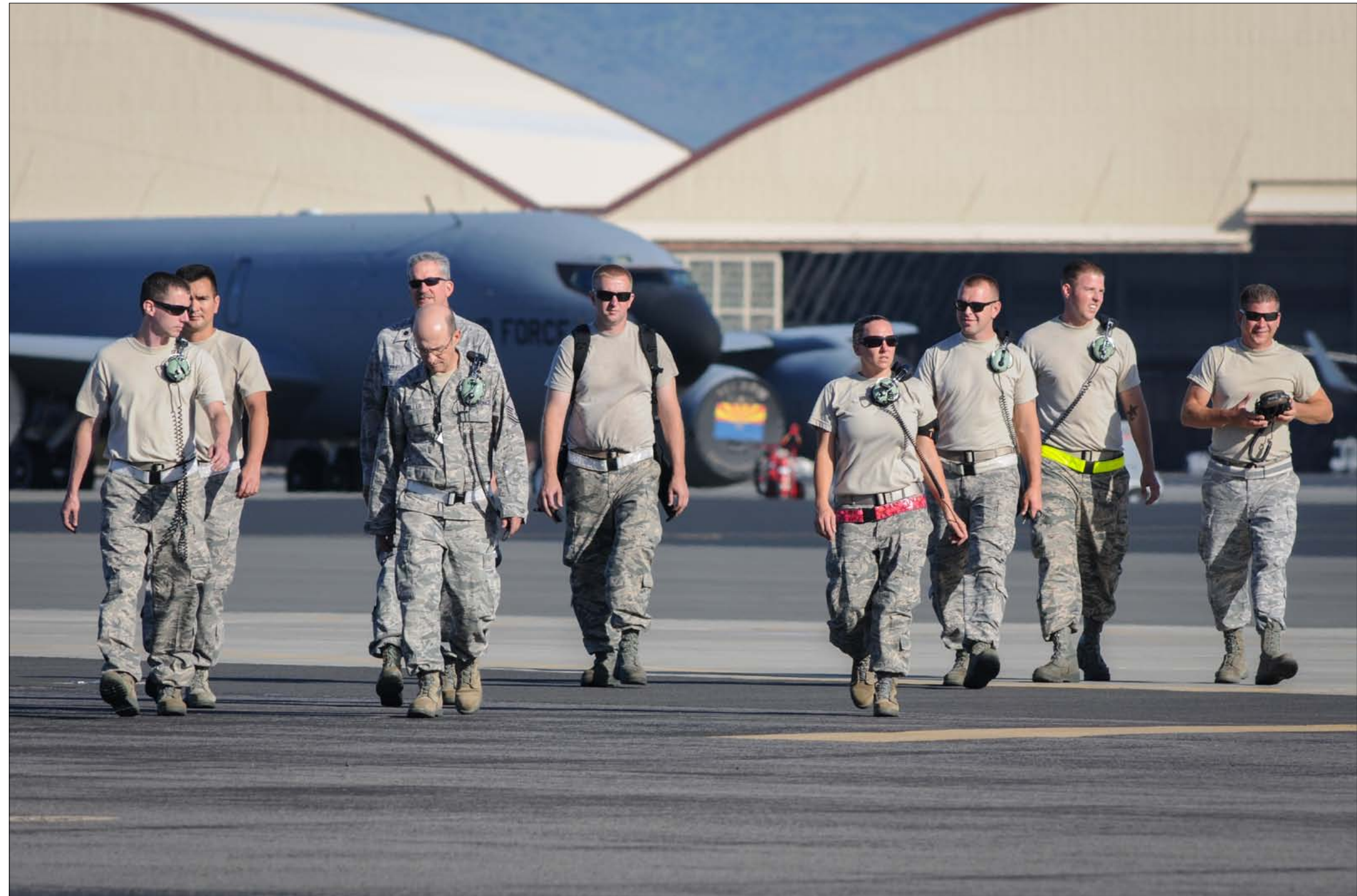
Maintenance reservists from the 513th Air Control Group at Tinker Air Force Base, Oklahoma, walk off the flight line after launching an E-3 Sentry Airborne Warning and Control System aircraft July 24 at Joint Base Pearl Harbor-Hickam, Hawaii. More than 60 reservists from the 513th Air Control Group traveled from Tinker to participate in the Rim of the Pacific, or RIMPAC, 2014 exercise, the world's largest maritime exercise held biannually in and around the Hawaiian Islands.