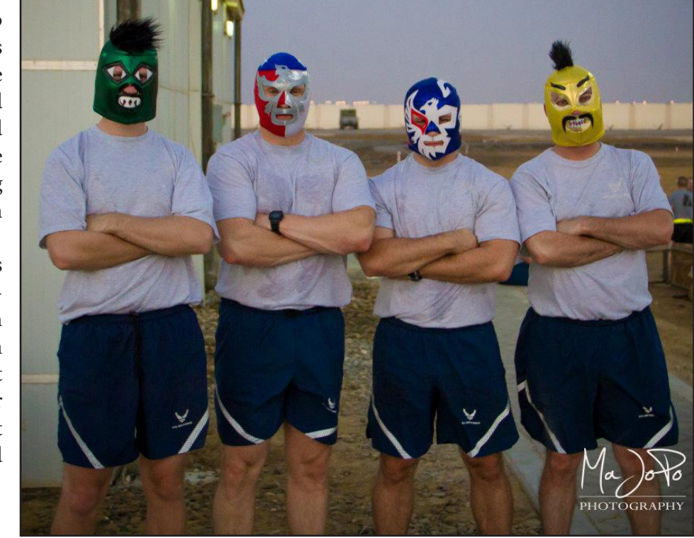
970th EAACS dodge ball team, July 2012.

Reservists who have prior motorcycle riding experience may complete a more advanced course, provided it is certified by the foundation.