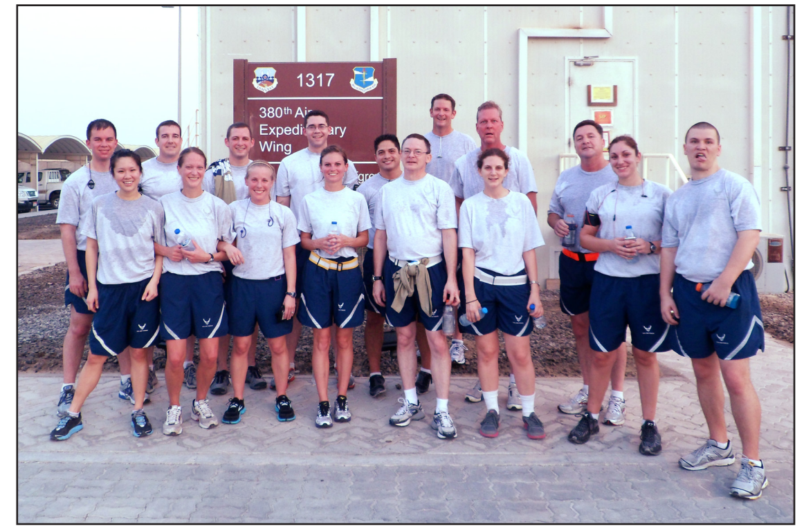
Post-run photo of the 970 EAACS members who participated in the 5k run.