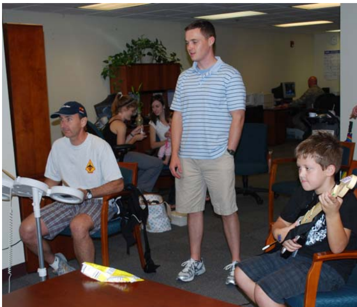
Talent lies in all ages