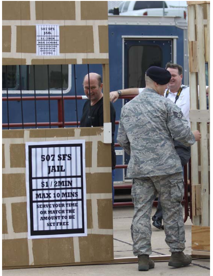
Jail time for the Commander