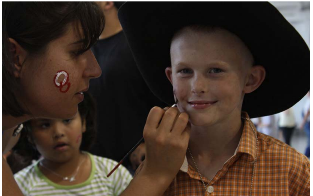
Face painting tickles