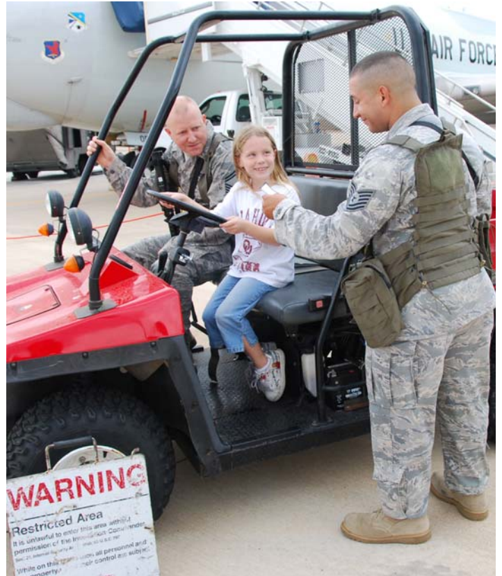
Speeding ticket or just a warning?