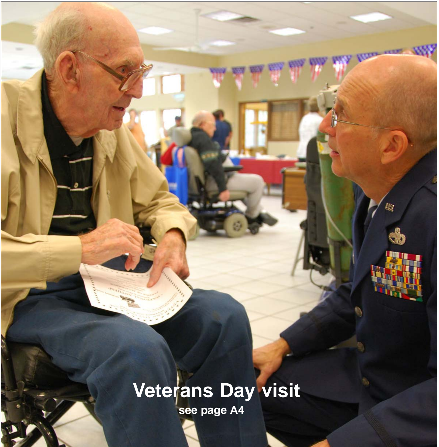
Veterans Day visit see page A4