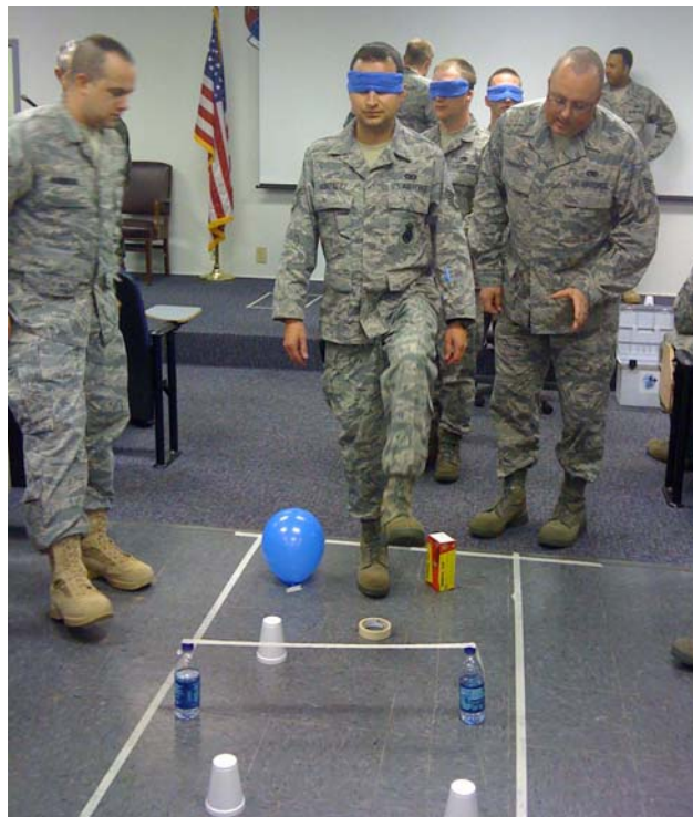
A student participates in a scenario focusing on trust where he is blind-folded and guided by other teammates.