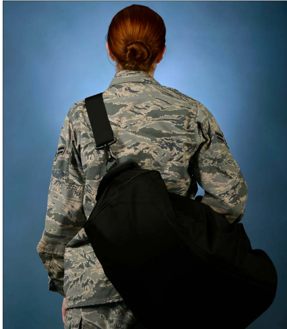
Air Force Instruction 36-2903, Dress and Personal Appearance of Air Force Personnel, was updated to include new uniform authorizations, such as the use of gym bag shoulder straps, Feb. 9, 2017. (U.S. Air Force illustration by Airman 1st Class Kathryn R.C. Reaves)

Examples of uniform changes include authorization for female Airmen to wear semi-formal slacks and low-quarter shoes with the semi-formal uniform; removal of color restrictions for form fitting undershirts and sportswear (spandex) with physical training gear; and removal of pleat and cuff requirements on informal uniform trousers.