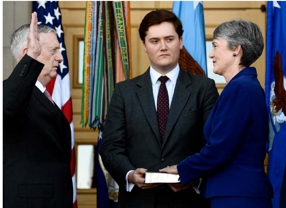
Secretary of Defense Jim Mattis delivers the ceremonial oath of office to Secretary of the Air Force Heather Wilson, making her 24th secretary, during a Pentagon event, May 16, 2017.

“History is not predetermined or static. History hangs on a hinge. Air supremacy is not America’s ordained right and there are other