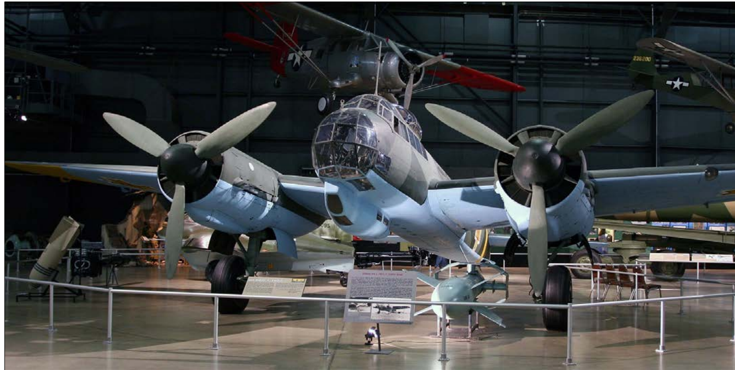
Junkers Ju 88D, which served in the German Luftwaffe in numerous variants, from bomber to night-fighter, during WWII, is on display in the Air Power Gallery at the National Museum of the United States Air Force in Dayton, Ohio. A defecting Romanian pilot flew his Ju 88 to Cyprus and in the hands of the British in 1943. The Royal Air Force then turned the aircraft over to the U.S. Army Air Corps, who painted the U.S. Air Force star on the fuselage and wings to spare it from Allied attacks as it made its way across the globe to Wright Field.

who then turned the aircraft over to the U.S. Army Air Forces. They gave it a distinctive American paint job, to keep it safe from friendly fire, as it made its way across the globe to Wright Field, Ohio.