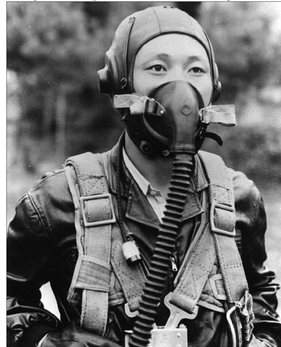
MiG-15 pilot Lt No Kum-Sok, pictured in 1953 wearing typical communist flight clothing. MiG-15 pilots did not wear g-suits or hard-shell helmets.

On 21 September 1953 a North Korean pilot defected, flying a MiG-15 jet fighter interceptor to Seoul, South Korea. In the process the pilot collected a $100,000 reward which had been offered by the United States Government. The United States Air Force quickly set about conducting flight tests to determine the capabilities, and limitations, of the Russian designed aircraft.