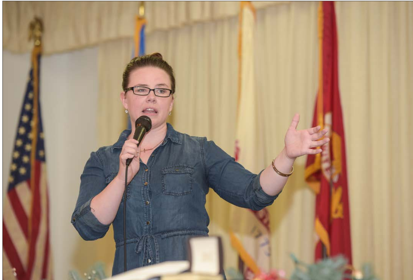
A member of the Oklahoma Air National Guard, 137th Special Operations Wing, tells a personal story about the impact of Operation Holiday Spirit on her life Nov. 5, 2016, at the VFW in Del City, Okla. Operation Holiday Spirit is expected to reach over $35,000 to support guard and Reserve Airmen in need this year.

Operation Holiday Spirit's 18th annual celebration took place Nov. 5, with attendees enjoying a traditional steak dinner--cooked and served by our own 1st Sgts.--before jumping into the excitement of fundraising bidding wars and raffle prize selections.