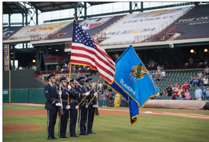
Airmen from Tinker Air Force Base's Honor Guard present the colors before the OKC Dodgers took on the Albuquerque Isotopes Aug. 19 at Chickasaw Bricktown Ballpark in Oklahoma City.