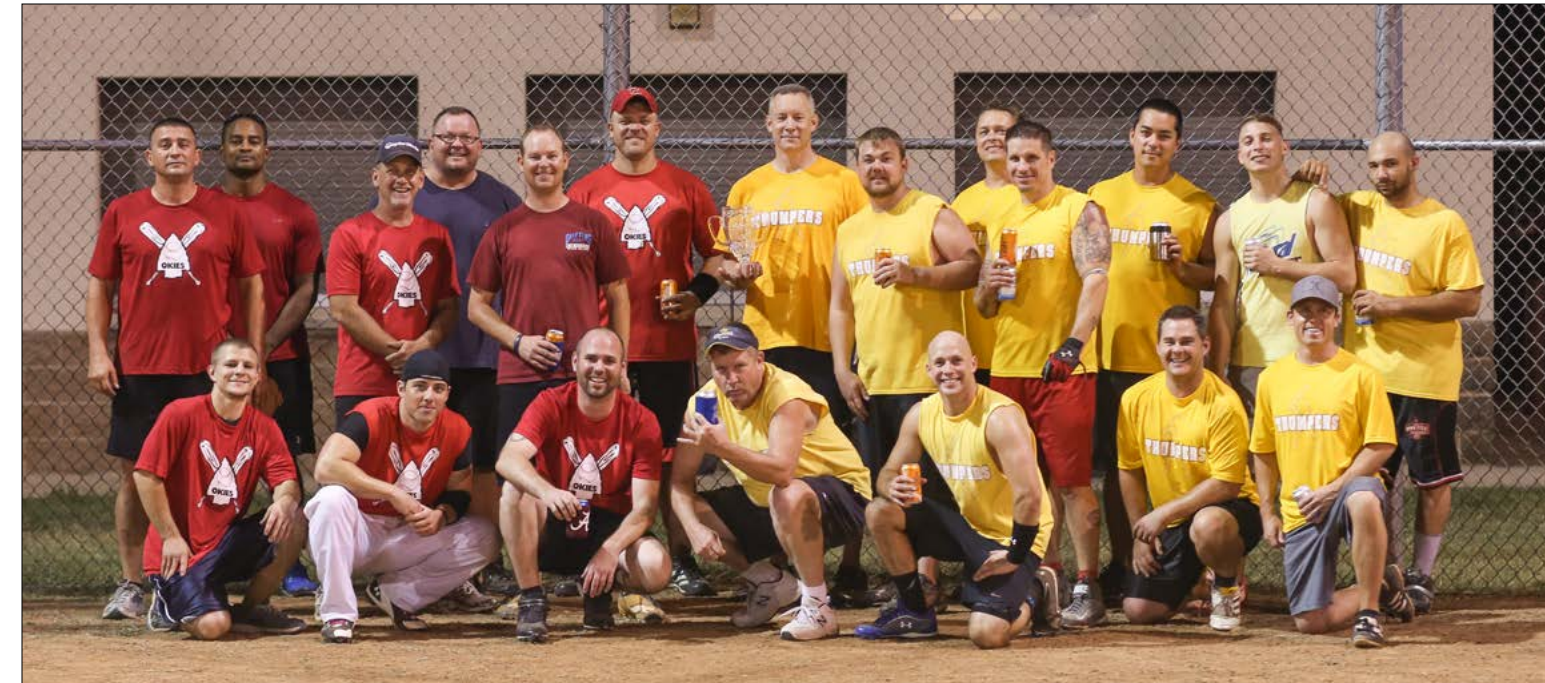
The 513th Air Control Group Thumpers and 507th Air Refueling Wing Okies pose for a group photo after playing a double header Oct. 15 at Tinker Air Force Base, Okla. The Thumpers retained the series trophy with two wins against the Okies, widening their all-time record to 55-44.

When the Okies face the Thumpers next summer in intramural softball, the game will mark the 100th time the two teams have played each other.