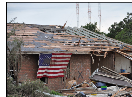
A United States flag hangs from a home devastated by a tornado that hit the town of Moore, Okla., May 20, 2013, near Tinker Air Force Base.