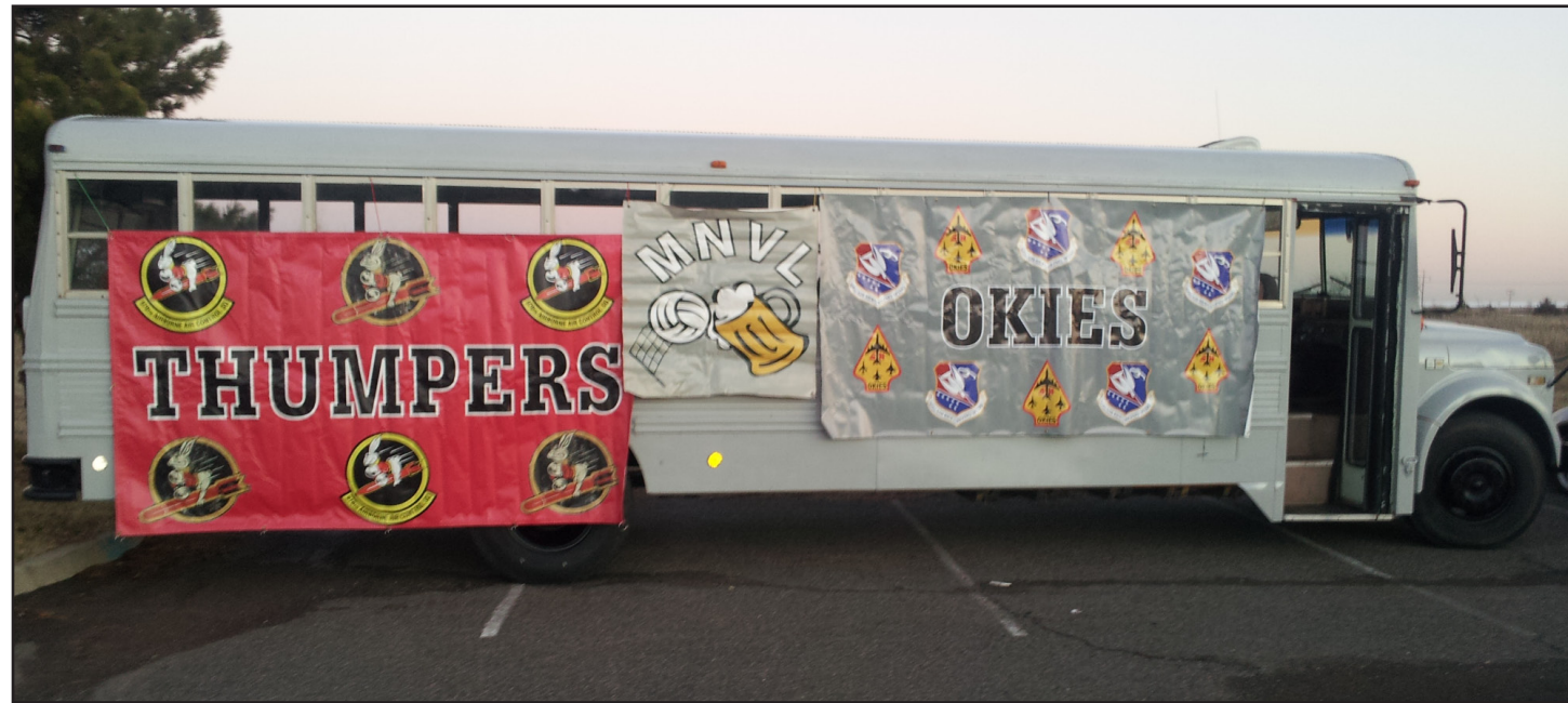
The newly-painted, joint Okie/Thumper bus for "off-duty events."