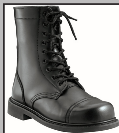
Black combat boots