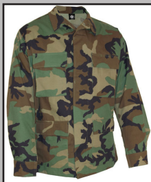
Battle dress uniform (BDU), in any combination