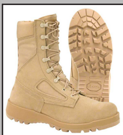
Desert/Tan combat boots at home-station